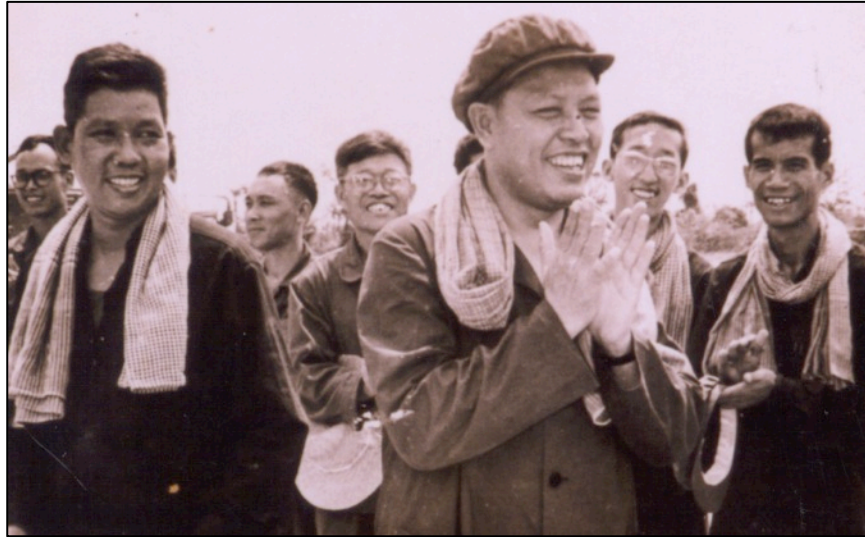
ECCC proceedings have been postponed until Wednesday, May 23, due to health issues of Ieng Sary, pictured above (front center) during the period of Democratic Kampuchea.