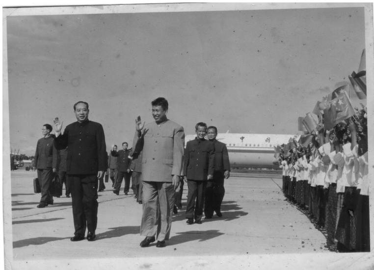
Pol Pot (front, left) walks with the Chinese delegation led by Wang Dongxing (front, right), during the delegation’s visit to Democratic Kampuchea on November 5, 1978. Khieu Samphan and Noun Chea follow behind. During this visit, Pol Pot is alleged to have asked for direct aid from China, but the request was purportedly rejected.