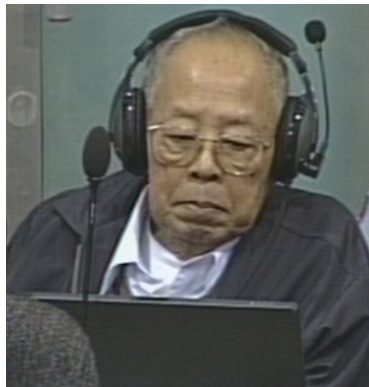
Ieng Sary continued to invoke his right to remain silent when asked for any comments during Thursday's proceedings.

The next document placed before the Chamber was an interview with Ieng Sary, wherein he stated that he changed his name in order to attend high school. Ieng Sary declined to comment on the document.