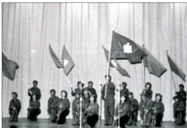
A Khmer Rouge dance group performs during the Democratic Kampuchea period.