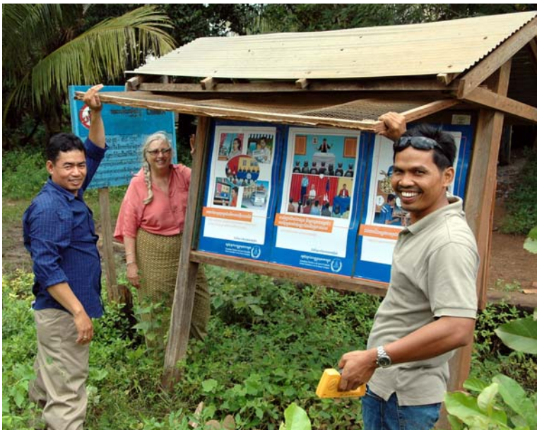
Outreach in Pailin

Kaing Guek Eav (Duch) Initial Hearing, date to be announced