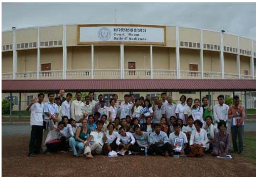
Youth and villagers from YFP visiting the ECCC.

The URC workshops were carried out with high school students and youth who left high schools at their communities. The workshops have reached 429 participants 52%, of them females. The youth who participated in the workshops learned of Khmer Rouge