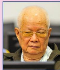
Khieu Samphan Former Head of State of Democratic Kampuchea