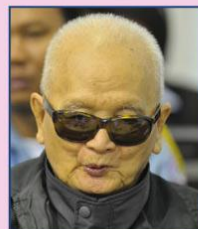
Nuon Chea Former Deputy Secretary of the Communist Party of Kampuchea