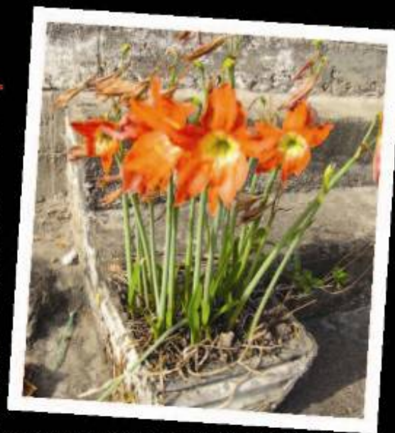
The graceful anemone with its bold blossom, sits on the steps of the freshly painted pagoda near dusk, at the top of Phnom Sampoc in Battambang province, Cambodia. Phnom Sampoc was used as a prison and execution site during the Khmer Rouge regime. Prior to being converted into a prison in 1975, residents, monks and nuns of this Buddhist pagoda were dispersed and dispersed. All types of people—men, women and children, some of whom were Khmer Rouge cadres—were arrested and detained at this pagoda-turned-prison. According to interviews cited in the Closing Order of the Khmer Rouge Tribunal, witnesses recalled discovering a device used to drain the blood out of victims whose throats had been cut. After the collapse of the Khmer Rouge regime, large number of dead bodies were found in various locations in and around Phnom Sampoc. The Closing Order put the estimate of death toll in this prison at the thousands. Local villages put the ultimate number of death toll at around 15,000. 25 February 2013.

Thirty years after the fall of the DK regime, Cambodia is still grappling with the painful legacies of genocide, torture, and mass atrocity. While Cambodians are a resilient people who are accustomed to hardship, bitter political disputes continue to cloud Cambodia's national identity, and there are questions about the impact and legacy of the