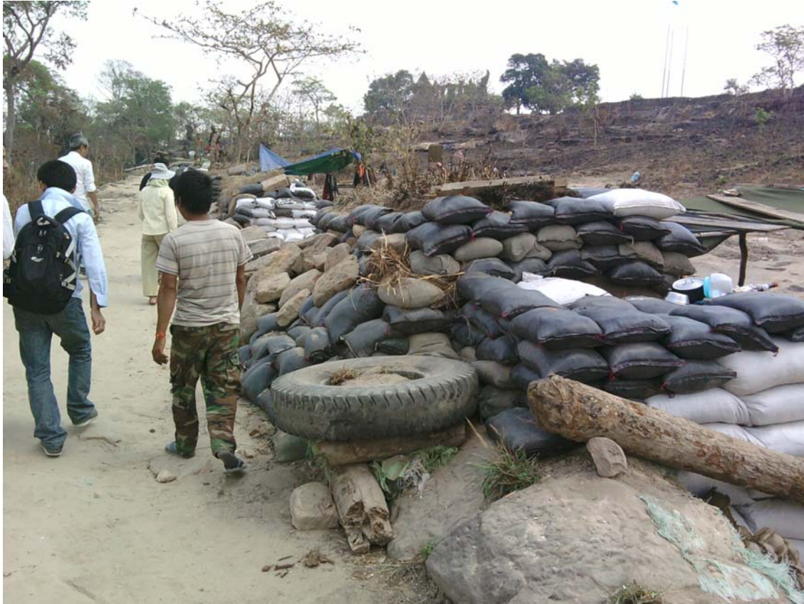
“Preah Vihear and Pra Viharn Conference: Pathways to a Shared Destiny” March 21, 2013

The Chumbhot-Pantip Conference Room Faculty of Political Sciences, Chulalongkorn University