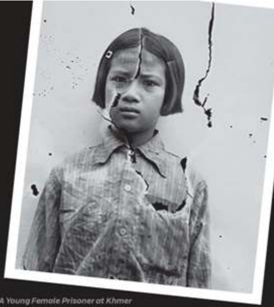
A Young Female Prisoner at Khmer Rouge Prison, 5-21

Our curriculum and training program revolve around DC-Cam's history textbook The History of Democratic Kampuchea . Our textbook has received plaudits from around the country and the world. It is the first of its kind, educating Cambodian youth about the Khmer Rouge tragedy after three decades of relative silence on the subject in Cambodia's schools. The book has been praised for its sensitive, yet candid depiction of DK history balancing intimate portrayals of horrific crimes with a solemn respect for the dignity of victims. Maintaining this balance between truth and sensitivity is an important quality of DC-Cam's education program, which aims to not only educate but also remember. Genocide education must serve the public need for knowledge about this time period but it must also do so in a manner that respects and empowers victims. In this