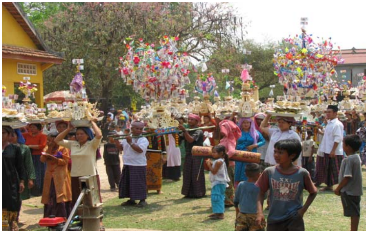
Mawlid Celebration Sre Prey village