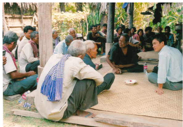
VPA Meeting in Kampong Thom Province

Prior to the field trip, the Project's staff members selected many of the villages to be visited based upon the existence of Renakse Petitions from those villages. The team identified Petitions containing the names of eighteen individuals who had resided in the villages in 1982-83. Of these eighteen individuals, the team successfully located eight Petitioners. The other ten Petitioners had either died, moved away or were too unwell to complete the Form. Of the eight Petitioners contacted, only one chose not to complete the Form due to his belief that the Court cannot offer justice because of to political influence.