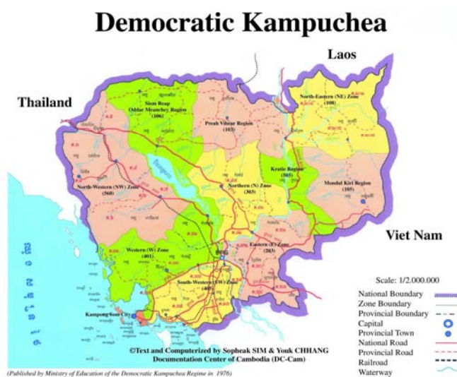
Map of Democratic Kampuchea in 1976

Kampong Thom Province is located in the center of Cambodia and is bordered by the provinces of Preah Vihear to the north, Kampong Cham and Kampong Chhnang to the south, Kratie to the east, and Siem Reap to the west. It has a total land area of 15,061 km 2 . The province has eight districts; namely, Baray, Kampong Svay, Stung Saen, Prasat Balangk, Prasat Sambau, Santuk, Staung, and Sandan. Kampong Thom Provincial Town is located 162 kilometers north of Phnom Penh. The province has a population of around 570,000 people, most of whom are engaged in farming and the timber industry.