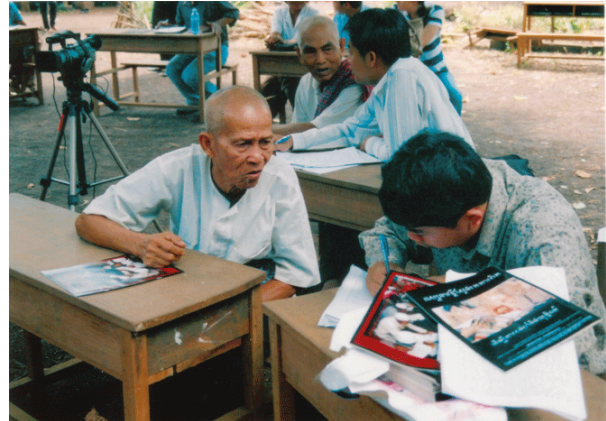
Staff Assist Survivors in Completing Form

The field trip to Kampong Thom Province proved very successful as the team collected over 300 Victim Information Forms for submission to the Victims Unit. The team hopes that the information contained in these Forms will prove helpful to the important work of the Court. Pleasingly, the Forms collected were far more complete than those collected previously due to improved training, supervision and checks for errors and omissions. In general, the Forms contained far more detailed responses to Part B's question on Description of Crimes with at least two pages of descriptive material in most cases.