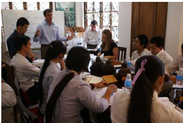
Training Session with Harvard Associates

The Project provides extensive training to its staff on an ongoing basis.