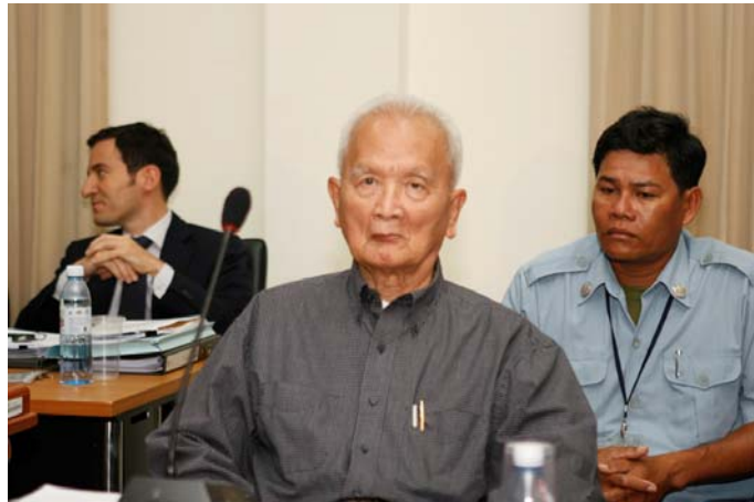
Nuon Chea Appeal Hearing

On February 7-8, the ECCC Pre-Trial Chamber held a hearing on Nuon Chea's appeal of his provisional detention. Nuon's attorneys argued that (1) Nuon had not validly waived his right to counsel at his initial appearance, (2) the four civil parties taking part in the appeal hearing did not have an interest in the specific legal issue at stake, and (3) there were