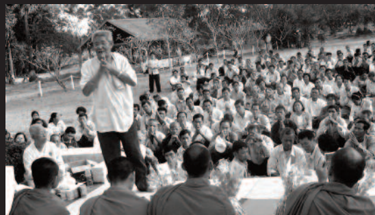
Khmer Rouge Victims at the Genocide Memorial site

Remembering the Victims of Democratic Kampuchea: DC-Cam also plans to compile and publish a book of names of all those known to have died under the Khmer Rouge regime. The compendium will be based on our research and will tangibly recognize and remember those who perished. To date, there are more than a million names in our