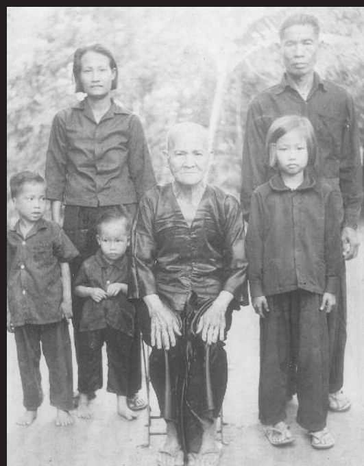
A Khmer Rouge Family in Kandal province, circa 1975 .

Between 2009 and 2011, the Documentation Center of Cambodia (DC-Cam) will continue pursuing its long-standing mission of promoting memory, justice, and reconciliation. We will compile further evidence of genocide and crimes against humanity and educate Cambodians on the historical facts regarding the Khmer Rouge regime. Our work will focus on the needs of ordinary Cambodian people—victims and their descendants—who are the keys to the country's past, present, and future. In addition to honoring those who died during the Khmer Rouge regime, it is crucial to reach out to and support living Cambodians in the country and around the world. This summary Strategic Plan outlines our plans to create enduring mechanisms that help overcome the shadows of Khmer Rouge terror and build a brighter future in Cambodia.