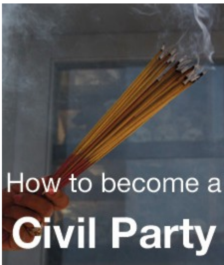
ECCC's new brochure on Cases 003 & 004

then issued its second severance order in March, limiting the scope to the same as before. In appeals against it, the prosecution requested to include S-21 to make the trial more representative while the Nuon Chea defence team asked for an annulment of the severance or, alternatively, an expansion to genocide and other alleged crimes at cooperatives and worksites.