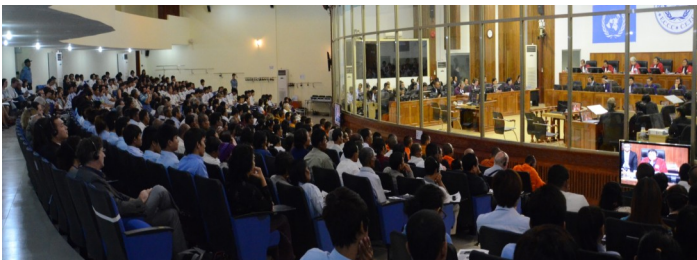
Hundreds of visitors observe the hearing of evidence in the first trial in Case 002.