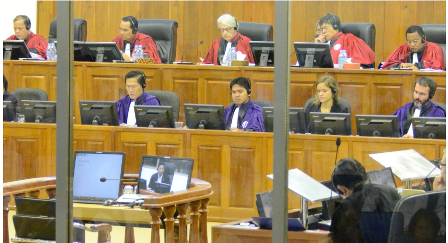
Judges of the Trial Chamber hear testimony of a witness in Case 002/01.