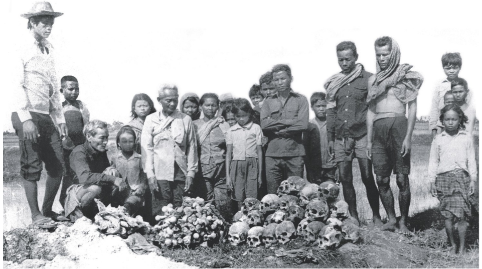
A number of execution sites similar to this site pictured in Svay Rieng in 1983 are part of the indictment in Case 002.

In order to avoid unnecessary delays in the conclusion of the Case 002/01 trial, the Supreme Court Chamber considers that instructing the Trial Chamber to begin the Case 002/02 trial as soon as possible would be more appropriate than ordering an expansion of Case 002/01.