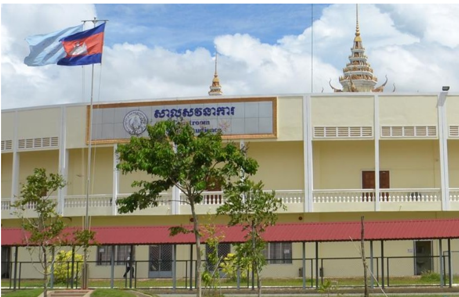
The court building of the Extraordinary Chambers in the Courts of Cambodia (file photo)

On 25 July, a UN Administrative Judge released a Decision which invalidates a decision by the Head of the Defence Support Section denying funding for travel for a legal consultant on the defence team of a named suspect in Case 004. The defence team issued a press release on the matter, which is available on the website of the Böhler Advokaten law firm.