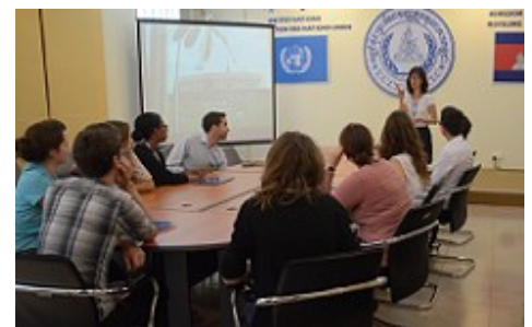
International visitors from the Cambodian Center for Human Rights and Destination Justice listen to a briefing on the overview of the ECCC.

Lastly, a group of election monitors from Japan who were accompanied by a journalist made a tour of the court on 25 July.