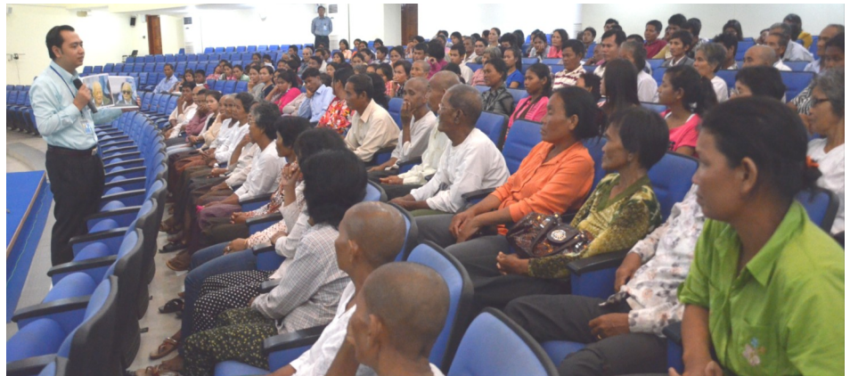
More than 220 people from Siem Reap listen to a briefing at the court during a study tour.

The ECCC has gone to great efforts to provide opportunities for as many ordinary Cam-