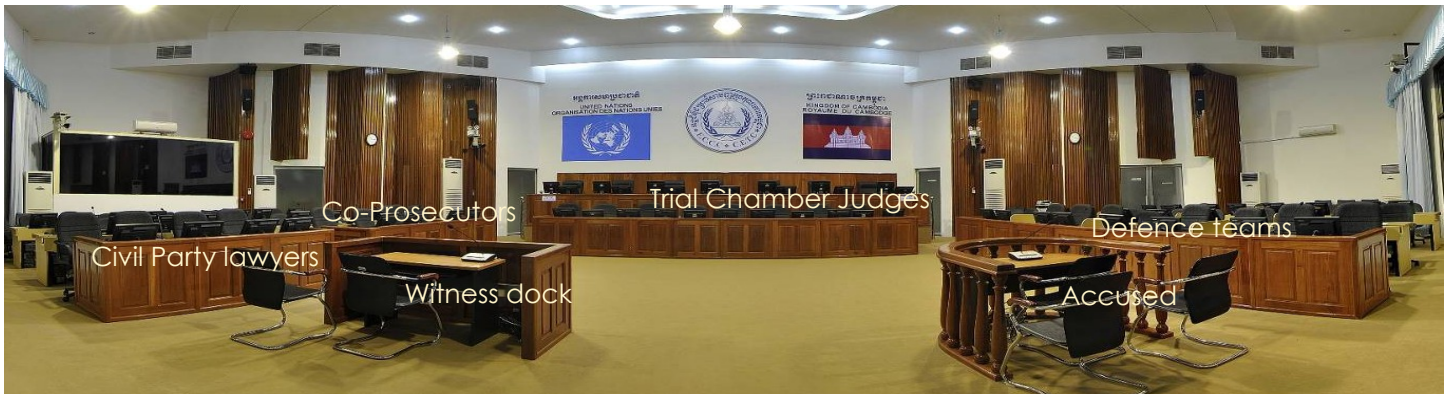
A panoramic view of the main courtroom in the Extraordinary Chambers in the Courts of Cambodia.

For an updated hearing schedule, please visit http://eccc.gov.kh/en/event/court-schedule