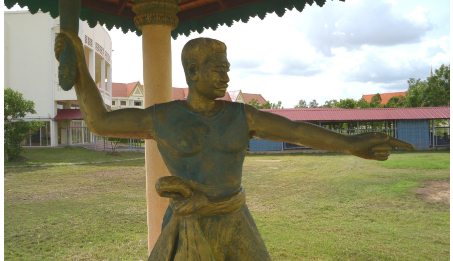
The Lord of the Iron Staff, a guardian spirit statue outside the ECCC court building. Cambodian witnesses and civil parties take oath in front of this statue before testifying in court.

The Lead Co-Lawyers, in cooperation with the Victim Support Section and project partners, continued their work on the content and budgeting and reparation projects through a series of meetings held over the course of the month. Additionally, they continue to work with partners to identify and prepare additional projects. The Lead Co-Lawyers also participated in a number of meetings with donors aimed at securing financing for Case 002/01 reparations projects. In a very positive turn for reparations, the German Federal Ministry for Economic Cooperation and Development agreed to provide funding for three reparations projects.