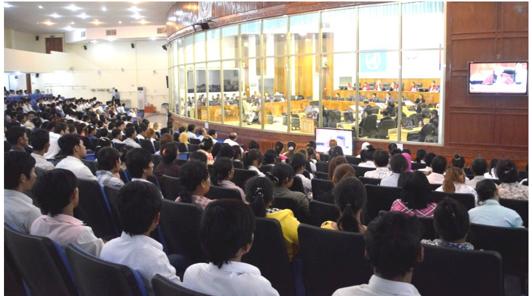
Hundreds of visitors observe the trial proceedings in Case 002/01 (file photo)