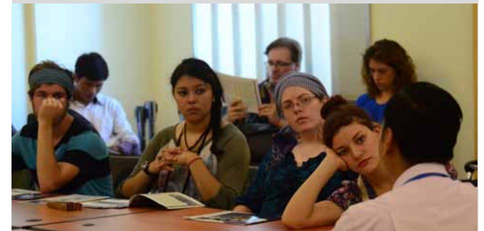
Students from the United States appreciated having the opportunity to learn about the work of the ECCC.

There was a broad consensus that justice should not only be served through trial judgements, but through community activities that foster an understanding of the trial process and its outcomes.