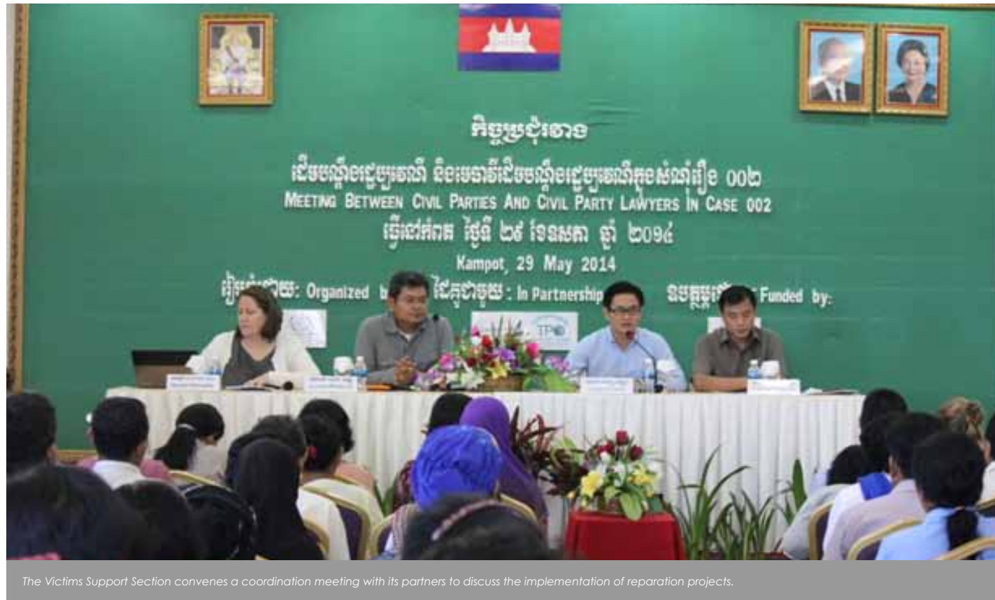
The Victims Support Section convenes a coordination meeting with its partners to discuss the implementation of reparation projects.

ceased. The objections concerned, first, the statute of limitations for grave breaches of the Geneva Conventions, and, second, jurisdiction over the crime against humanity of deportation in respect of determined crime sites.