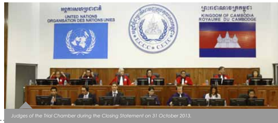
Judges of the Trial Chamber during the Closing Statement on 31 October 2013.

The hearing will be open to the public and the media. If discussion on potential witnesses, civil parties and experts warrants the holding of some portions of the hearing in closed session, such closed sessions will be held at the end of the hearing.