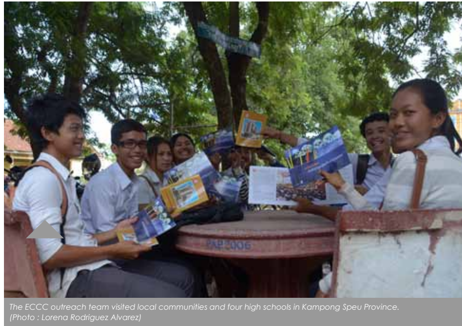
The ECCC outreach team visited local communities and four high schools in Kampong Speu Province.

The students were very curious to learn more about the ECCC outreach programme and they were keen to discuss what they knew and had learned about the Khmer Rouge and the trials. They even shared personal stories about their families during the regime and their hopes for the future.