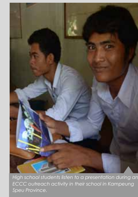
High school students listen to a presentation during an ECCC outreach activity in their school in Kampeung Speu Province.

June: (KRT Watch Program) CHRAC will hold a half-day legacy workshop with university students. The theme of the event is "Annotated Cambodia Code of Criminal Procedure and Important Strategies for the Implementation of ECCC's Best Practice and International Fair Trial Standards".