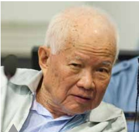
Khieu Samphan, former Head of State of Democratic Kampuchea.