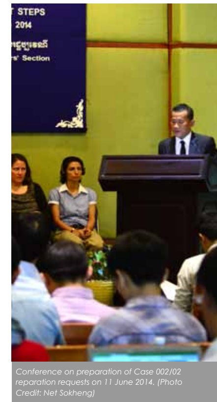
Conference on preparation of Case 002/02 reparation requests on 11 June 2014.

These bodies will work in partnership to provide financial, political and technical support for project development and implementation, in the interest of bringing redress to victims of the Khmer Rouge regime. Such projects seek to uphold the dignity of victims, retain collective memory and mitigate the harms experienced. The realization of any reparation claim of the civil parties is dependent on the conviction of the Accused.