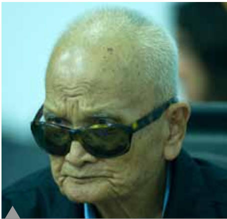
Nuon Chea, former Deputy Secretary General of CKP.