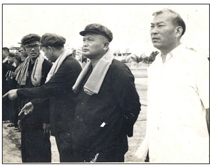
Son Sen, Ieng Sary, Nuon Chea, and Vorn Vet (from left to right) appear together during the Democratic Kampuchea period.

<sup>82</sup> The relevant ERNs are 00053634 (in Khmer), 00184067 to 68 (in English), and 00301354 (in French).