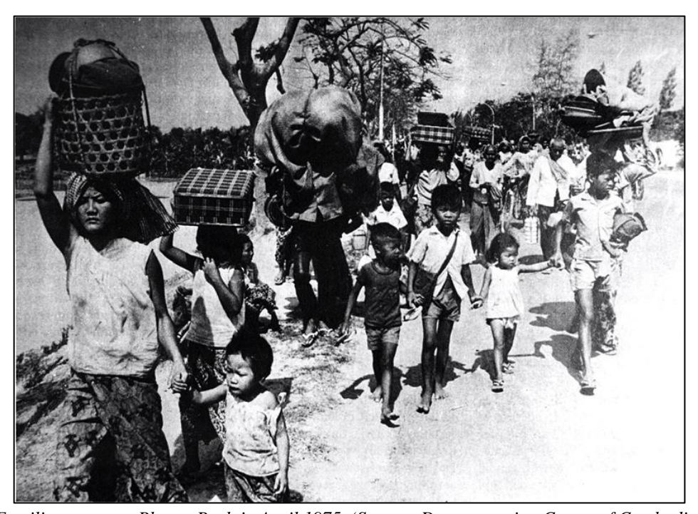
Families evacuate Phnom Penh in April 1975.

Through each stage of being questioned, as we were questioned in detail as to where our native village was and what work we did in Phnom Penh. In my case, I was asked where I was born, what my parents' names was, whether I was married or not, what work I did. Mr. President, I told them lies. I told them I was a taxi driver ... so I lied to them. I told them that my village was just the next village, and I was allowed to go. But for others, they were not lucky and they were taken. We were not the villagers. There were no other villagers nearby there. There were only soldiers. So we were questioned, and some of us were taken away, but I didn't know what happened to them. And that process continued until I arrived at my wife's native village.