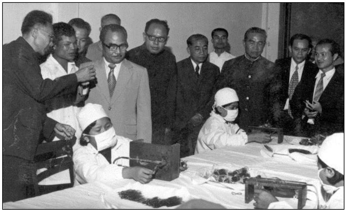
Prince Sophanavong (in gray jacket) of Laos, accompanied by Khieu Samphan and Ieng Sary, watches medical staff perform their work at a hospital in Phnom Penh during DK regime.