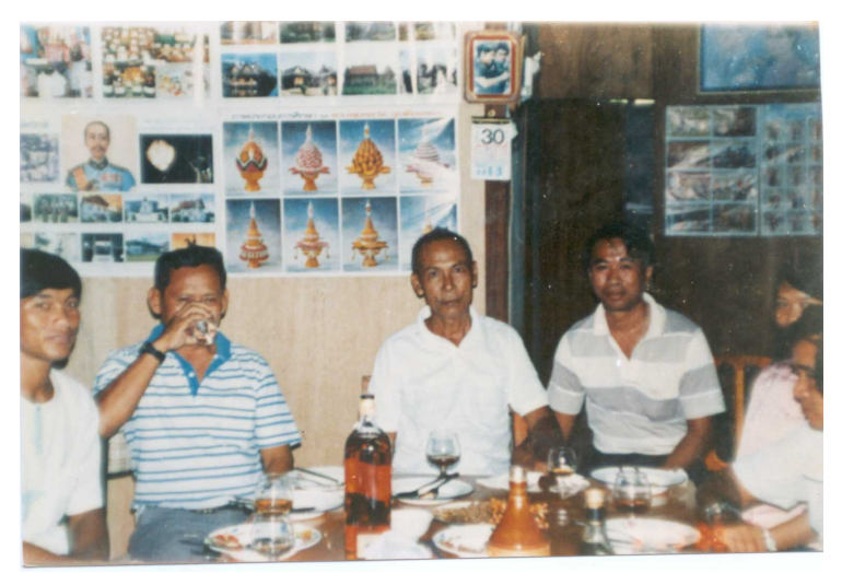
Ta Mok (center) eats a meal with friends and relatives in the 1980s near the Cambodian-Thai border