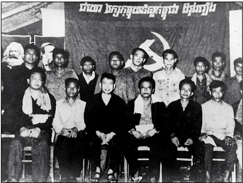
Khmer Rouge leaders during the struggle in the 1971. Nuon Chea is seated on the far left with Pol Pot seated third from the left.