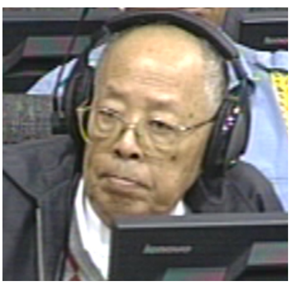
Objections raised by Ieng Sary's defense were the focus of much of the prosecution's arguments in the ECCC on Wednesday.