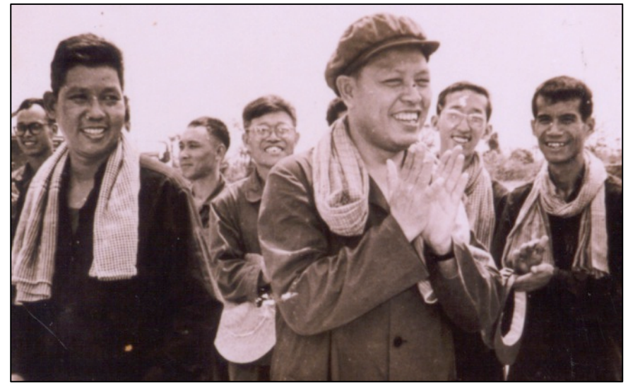
ECCC proceedings have been postponed until Wednesday, May 23, due to health issues of Ieng Sary, pictured above (front center) during the period of Democratic Kampuchea.