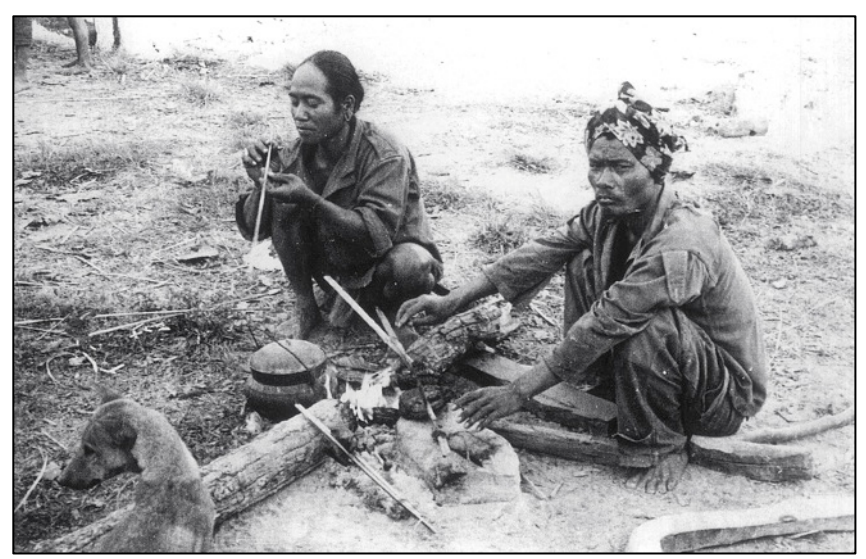
The two men pictured were members of a minority group that lived in the northeast of Kratie province near the foothills. The Khmer Rouge began occupying Kratie and other northeastern provinces shortly after the 1970 coup by Lon Nol.

The tribal people, the witness explained, practiced animism: "After the harvest season, for example, they would offer animal sacrifices." The people were told by district or commune leaders to be more "economical," and as a result, the witness concluded, they could not be wasteful by sacrificing the animals needed for food.