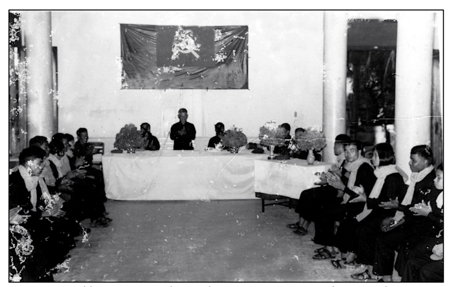
Wedding ceremony during the Democratic Kampuchea period.

In what became the most "entertaining" dialogue of the day, Mr. Lysak proceeded to ask the witness about marriage policy and procedure during DK. Although the witness had appeared increasingly tired through the day's examination, the discussion of marriage seemed to invigorate him. Some answers seemed more like a line from a romance novel than a statement by a former Khmer Rouge district secretary.